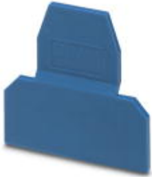
End cover, Length: 56 mm, Width: 2.5 mm, Height: 62 mm, Color: blue

Please be informed that the data shown in this PDF Document is generated from our Online Catalog. Please find the complete data in the user's documentation. Our General Terms of Use for Downloads are valid ( http://download.phoenixcontact.com )